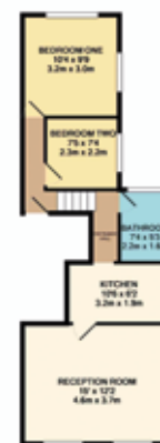
TOTAL APPROX FLOOR AREA 400 SQ FT (36.9 SQ M) This floor plan is a guide only and does not constitute an offer of a specific property. The actual property may vary from the floor plan. The floor plan is for information only and does not constitute an offer of a specific property. The actual property may vary from the floor plan. The floor plan is for information only and does not constitute an offer of a specific property. The actual property may vary from the floor plan.