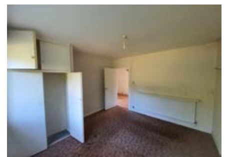
GROUND FLOOR 842 sq ft. (78.2 sq m.) approx.

Friday 25th August @ 12.30 – 1pm Saturday 2nd September @ 12.30 – 1.30pm Wednesday 6th September @ 12.30 – 1pm